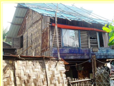
This is the old building of Samaritan Baptist Church. It will be replaced with a new one later this year.

Most of the people of the church live in a slum area near Yangon. Many come from Buddhist and Muslim backgrounds. They are very poor, but rich in spirit.